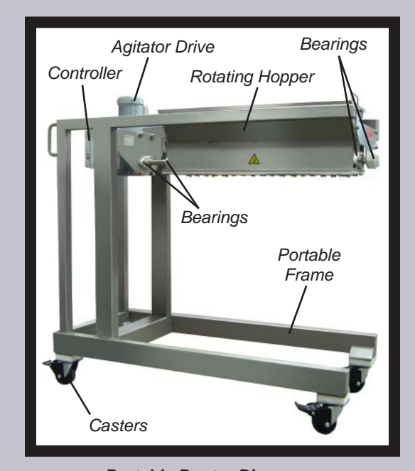
Portable Duster-Dispenser (With Rotating Hopper for Flour Removal)

DC: 115/60/1 (90 volt DC) and 230/60/1 (180 volt DC).